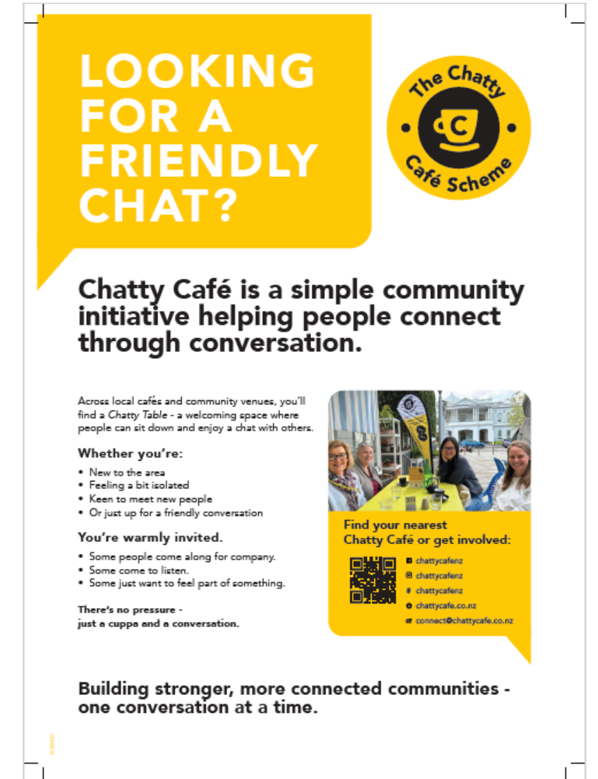
General Community Poster