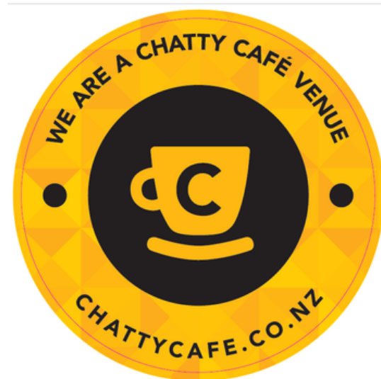
Chatty Cafe Window Sticker